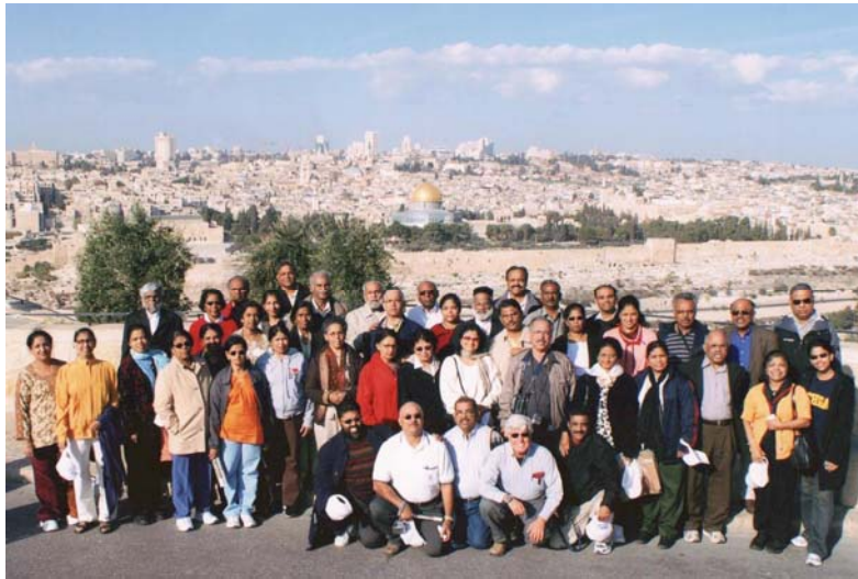
Group picture of the November 2006 Holy Land Trip.